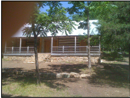
Beneath the shade of the walnut trees, the historic log cabin gives volunteers a chance to experience “hands-on history” of the land where we live.