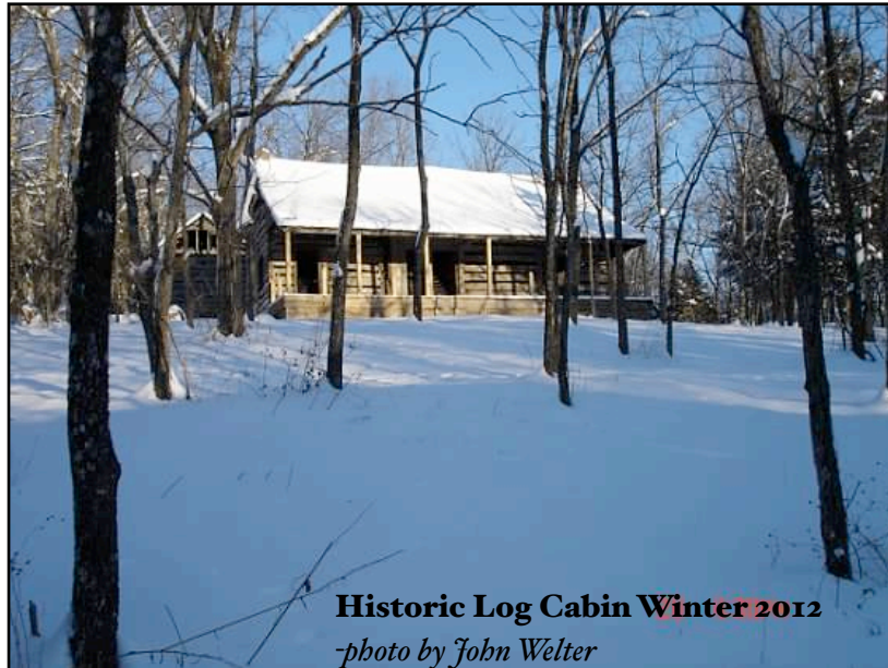
Historic Log Cabin Winter 2012